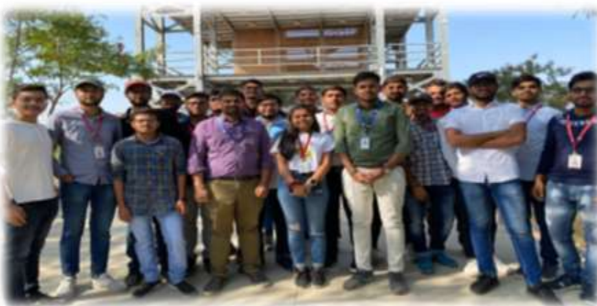
Mechanical 4 th & 6 th semester students visited Gujarat Solar Park, Patan on January 17, 2020.