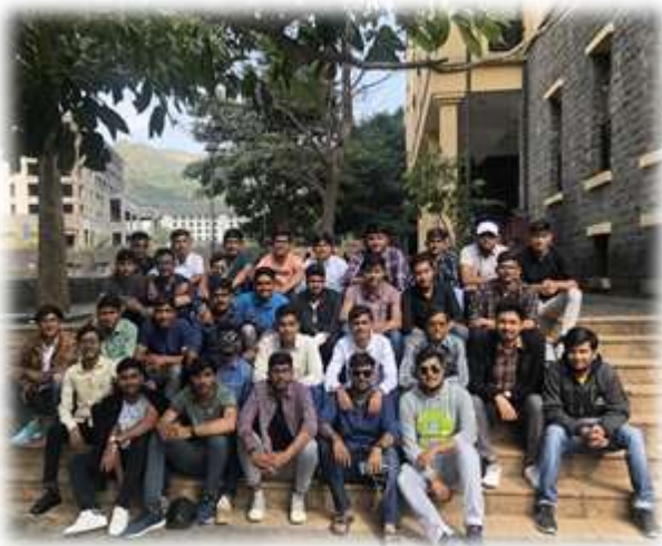
Civil Engineering 6 th & 4 th semester students visited Lavasa smart city during January 20-22, 2020.