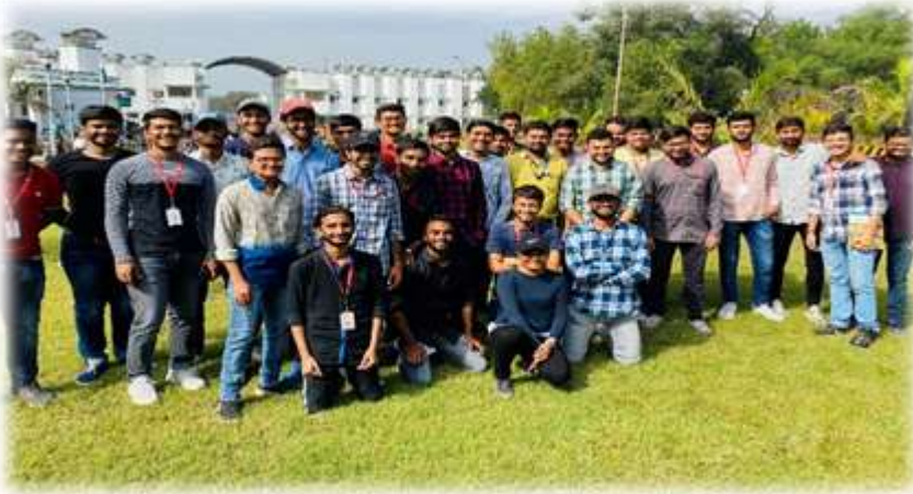
Mechanical Engineering 6 th semester students visited Kakrapar Atomic Power Station on January 25, 2020.