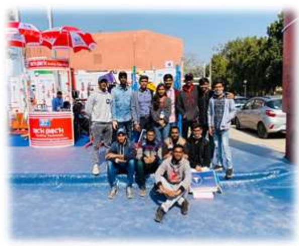
Mechanical Engineering 6 th semester visited Auto Expo 2020 at Delhi and Defence expo 2020 at Lucknow during February 6-10, 2020.